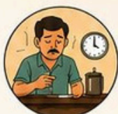
Long Wait Times

In Crowded Bazaars Chai service remained unorganized, slow, and inconsistent.